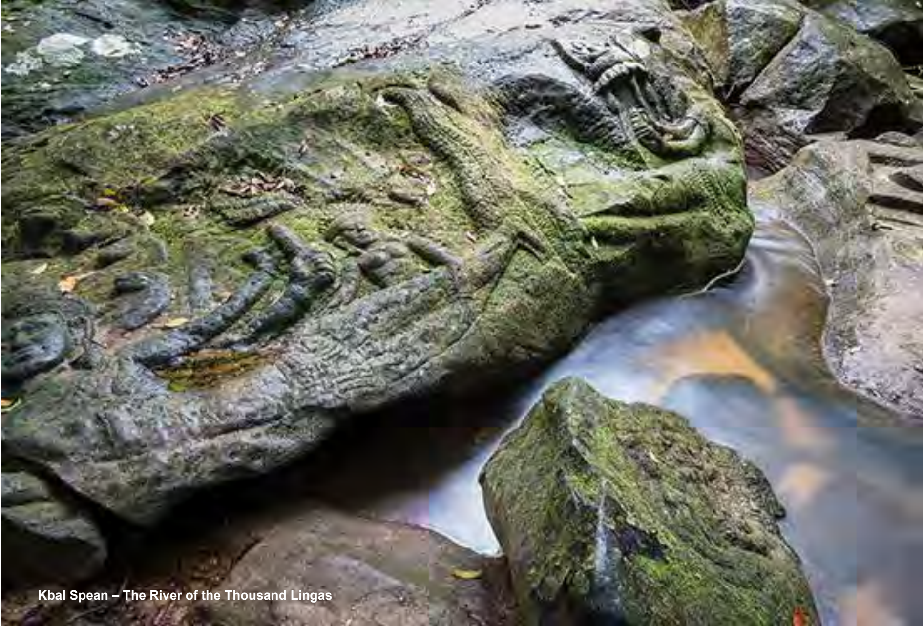
Kbal Spean – The River of the Thousand Lingas