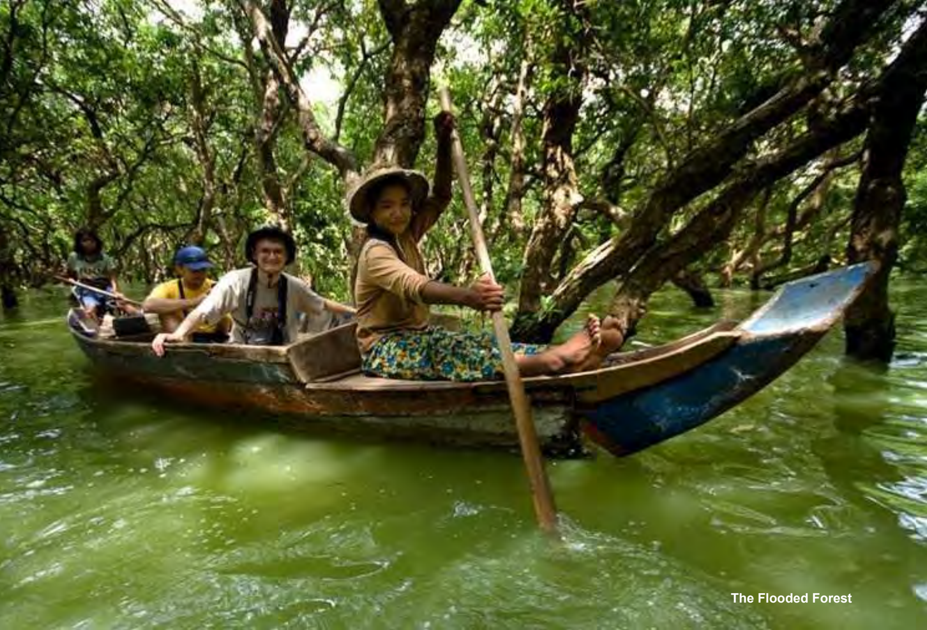
The Flooded Forest