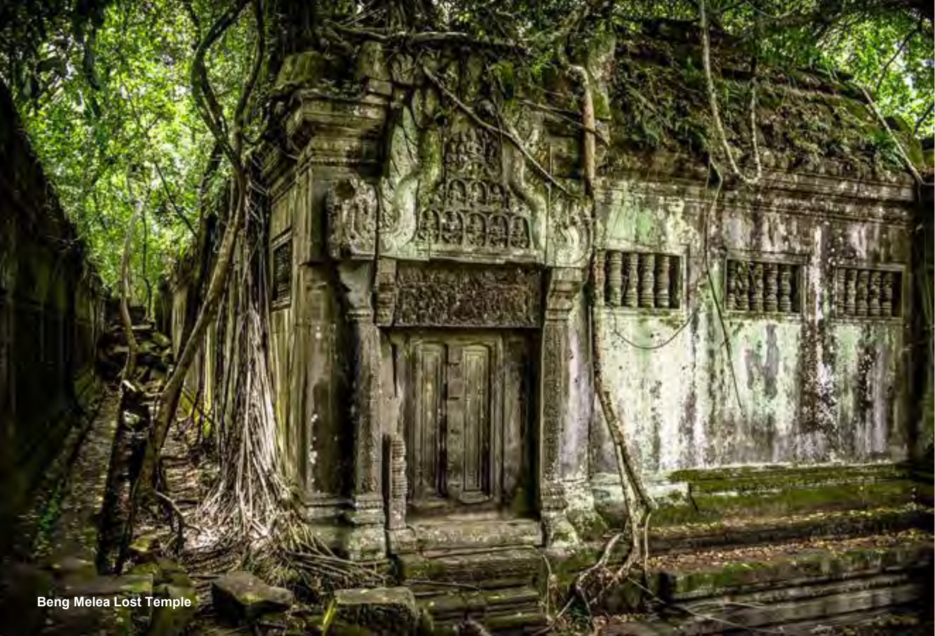
Beng Melea Lost Temple