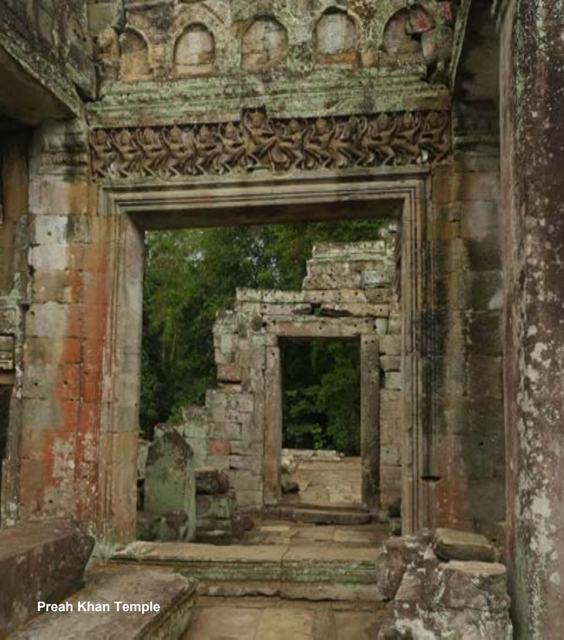
Preah Khan Temple