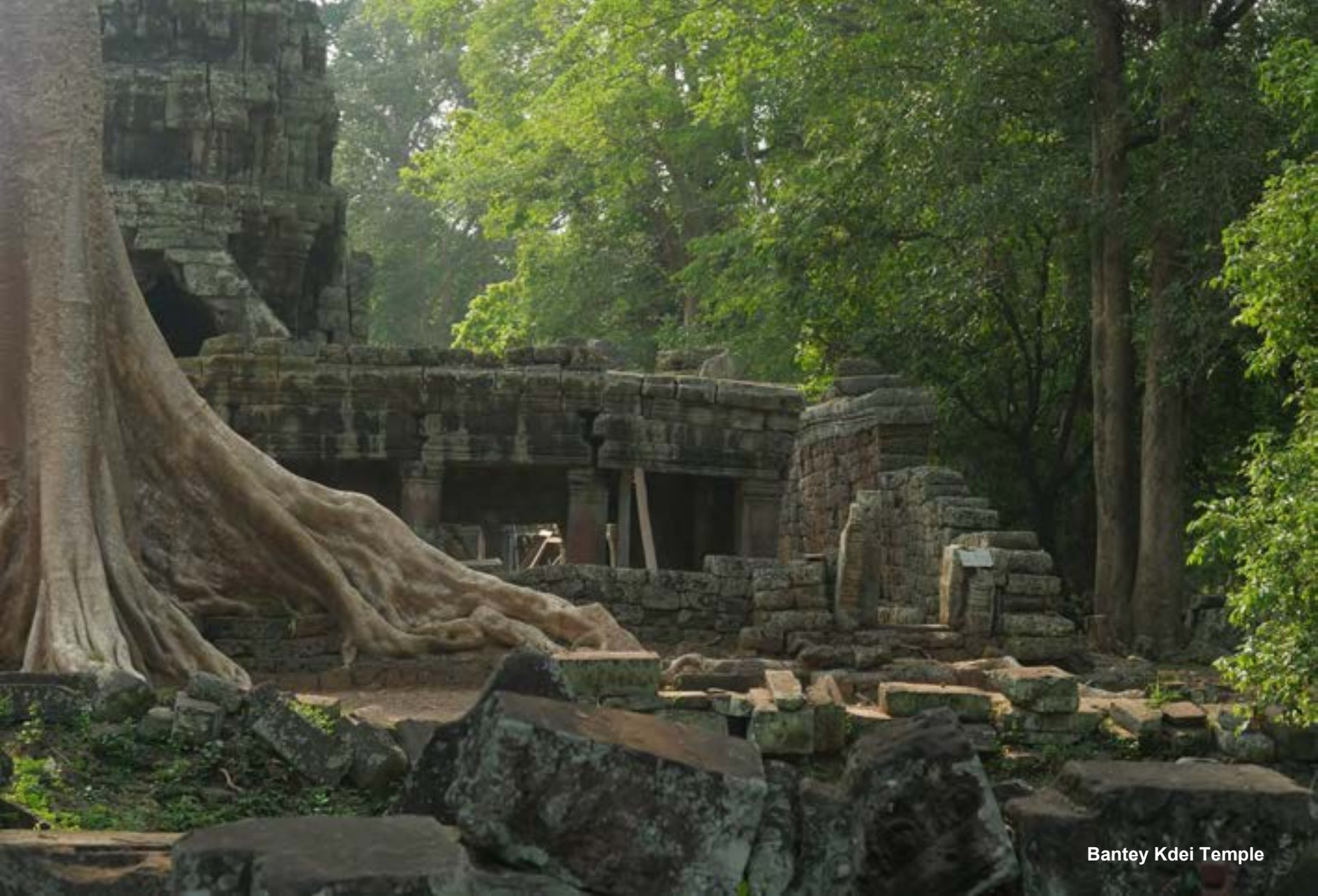
Banteay Kdei Temple