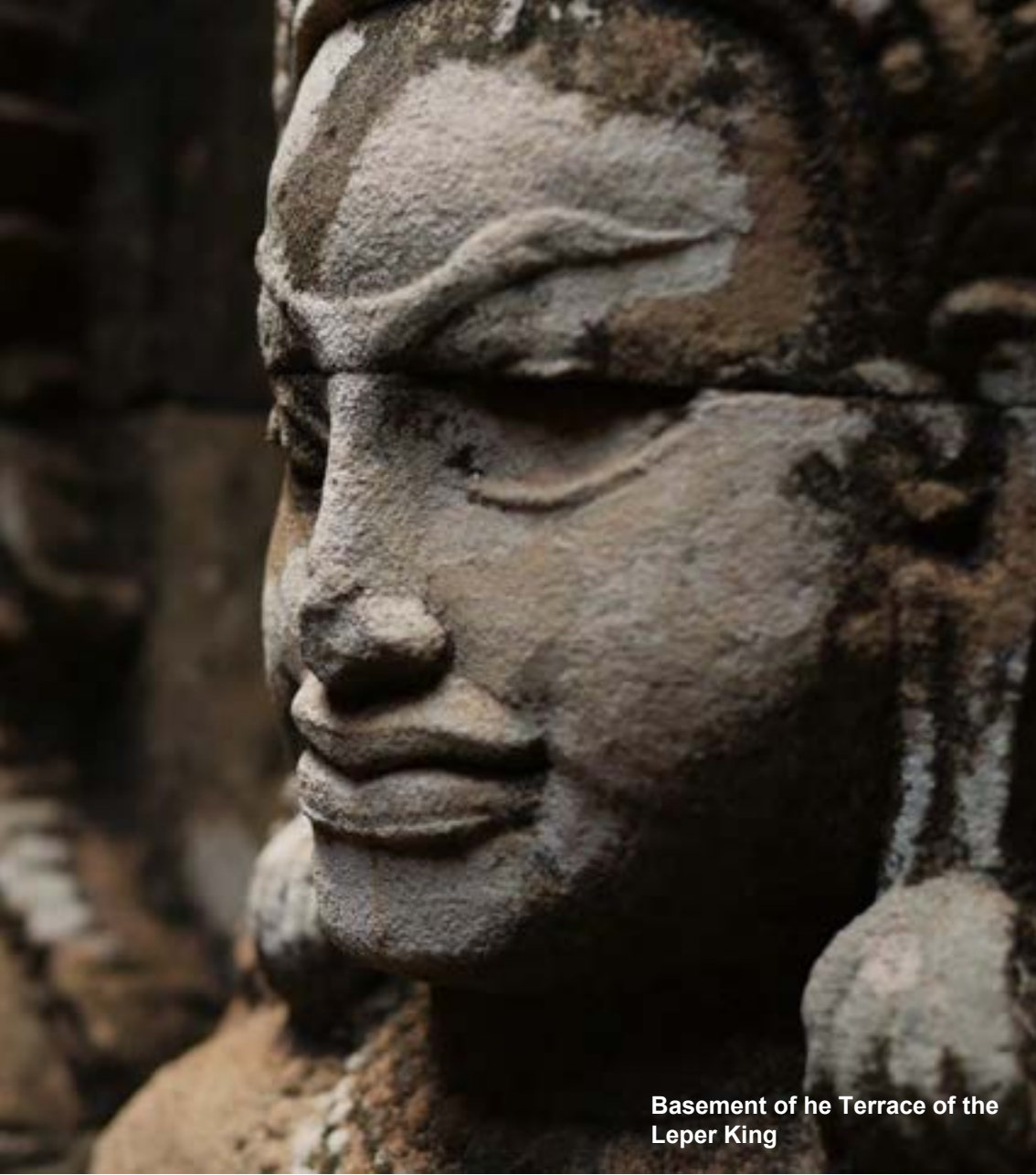
Basement of the Terrace of the Leper King

The first stop is at a very photogenic SOUTH GATE of ANGKOR THOM City , where gods and demons line the road leading to the gate struggling in a cosmic tug of war. The gate itself is crowned with four large faces facing in the cardinal directions.