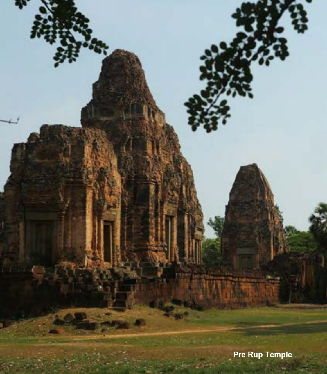
Pre Rup Temple