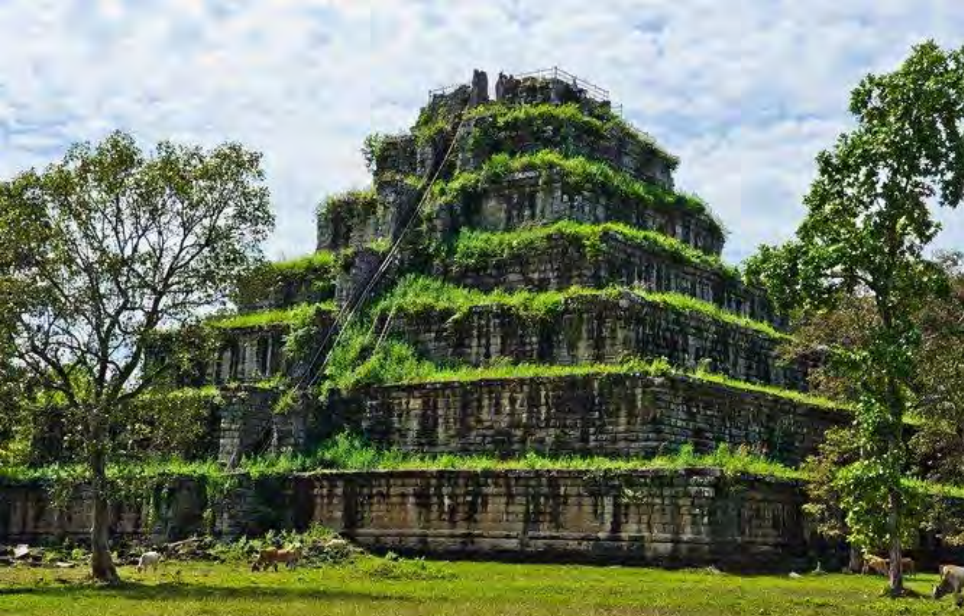
Koh Ker Temple