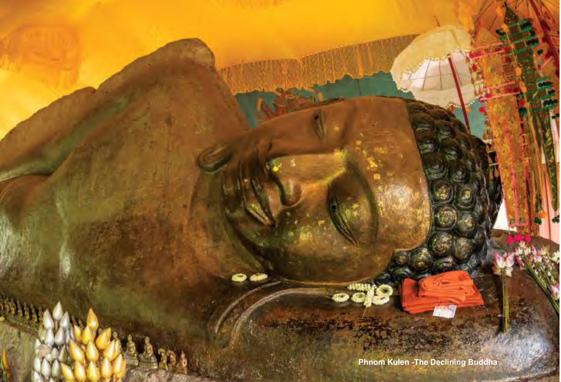
Phnom Kulen -The Declining Buddha