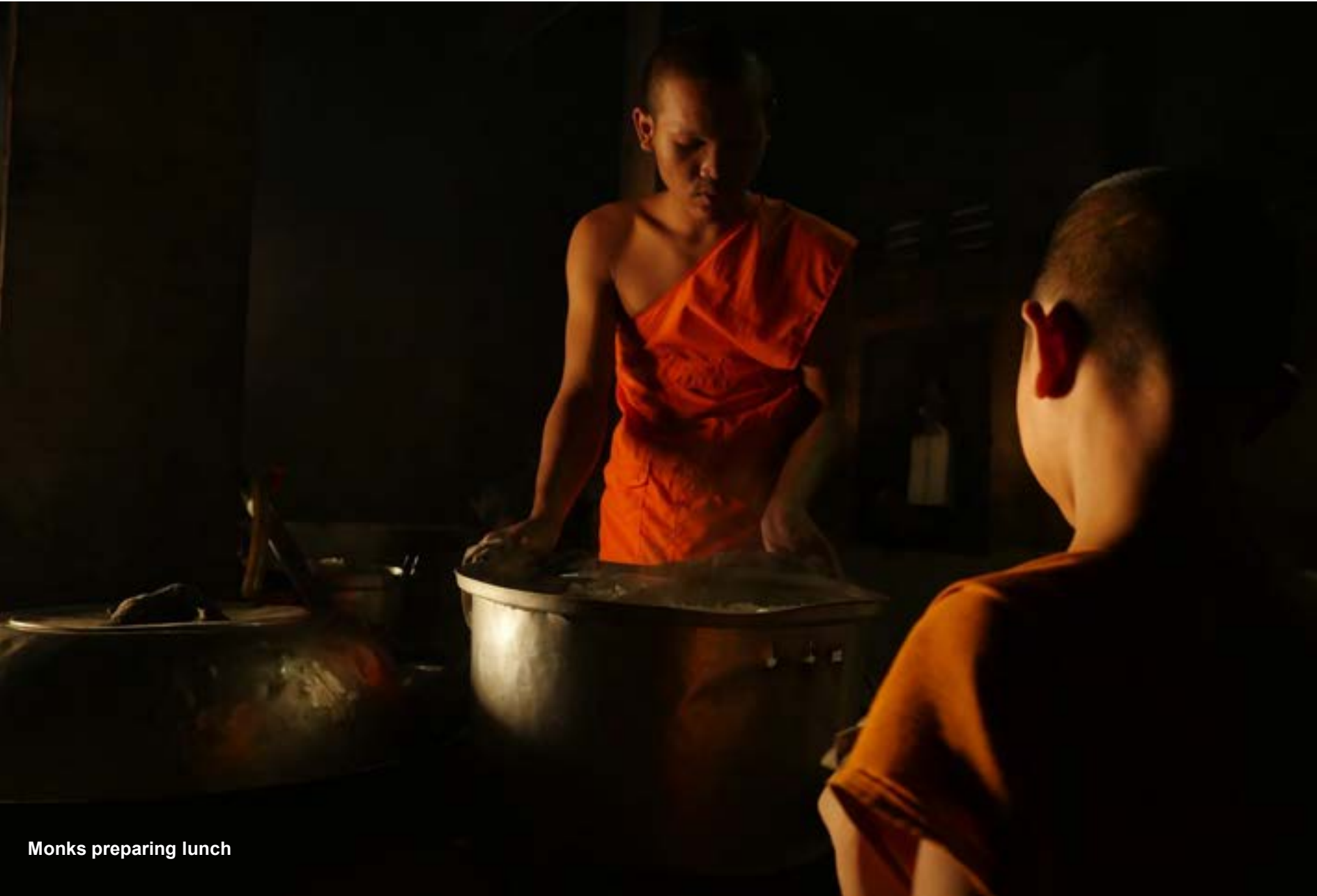
Monks preparing lunch