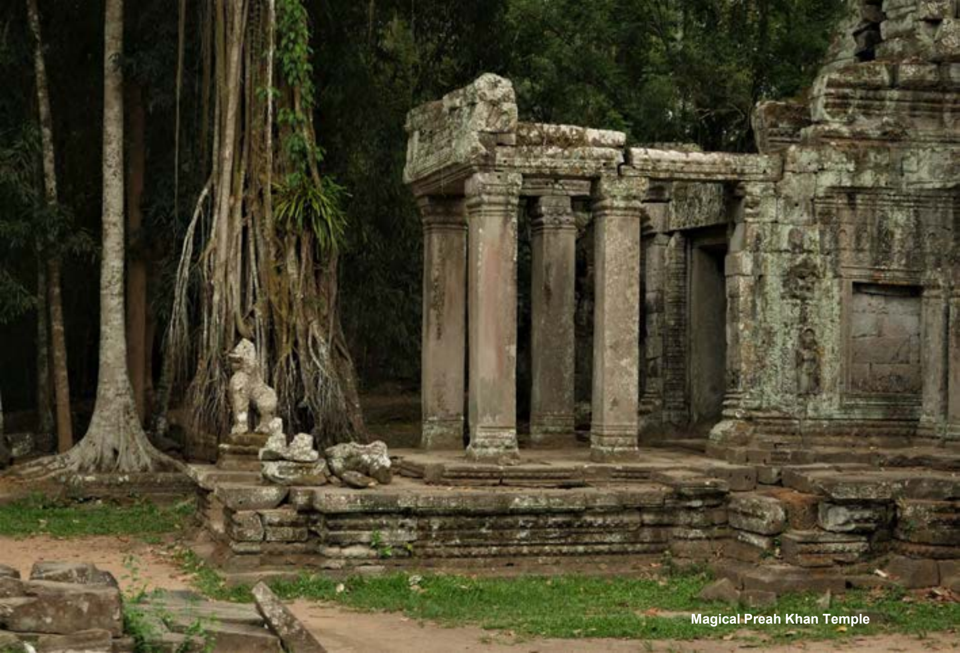
Magical Preah Khan Temple