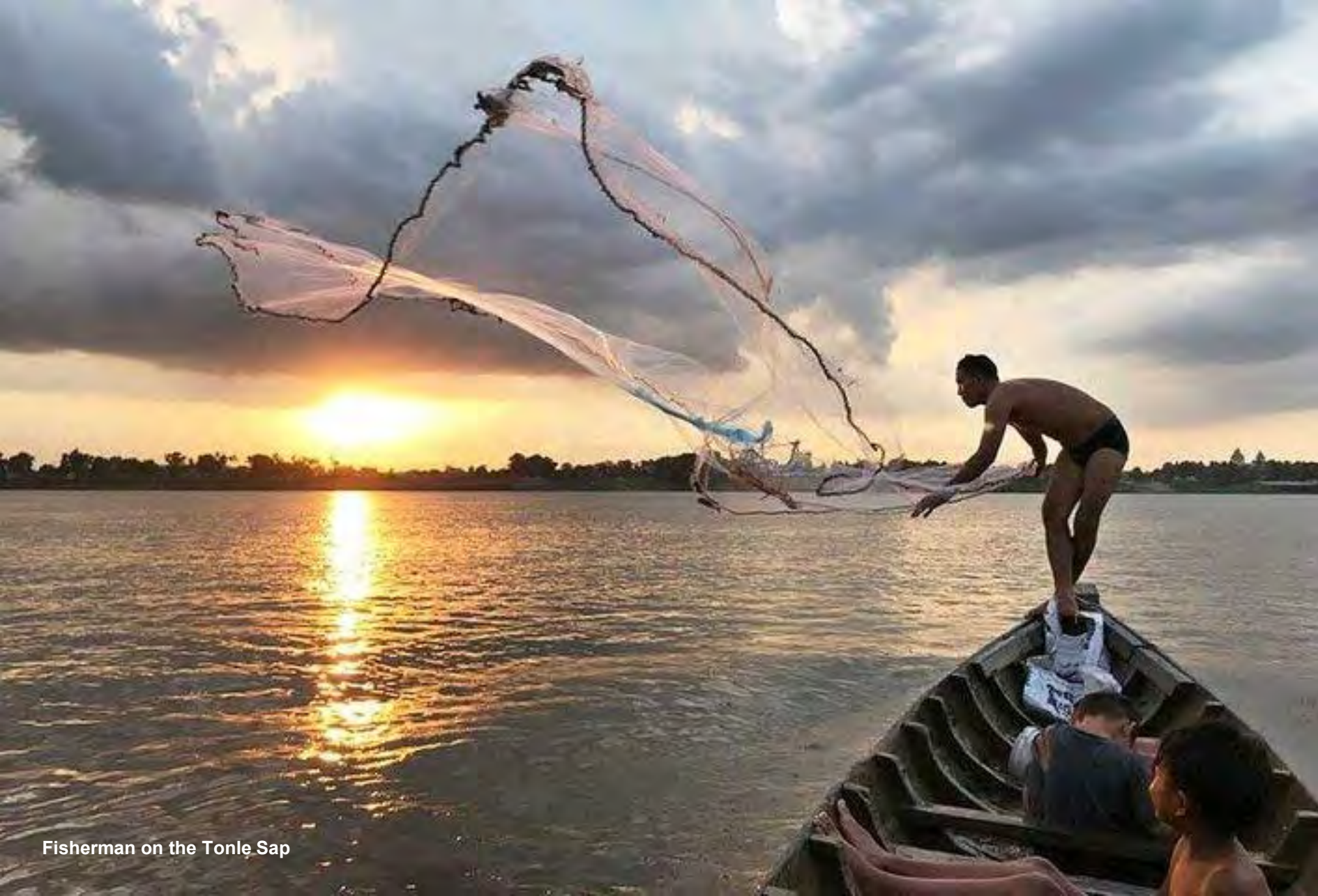
Fisherman on the Tonle Sap