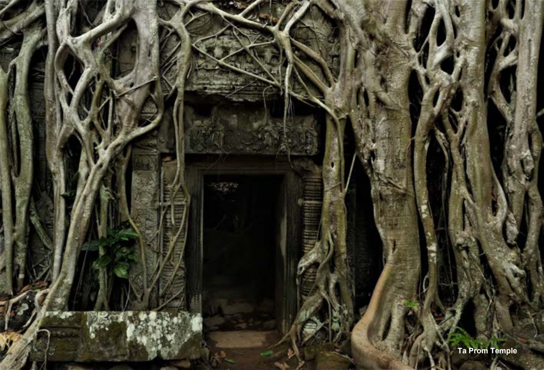
Ta Prom Temple